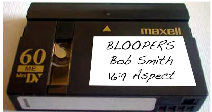
Label the tape, not the box

If you have a tape put a leader in front of your epic. Now a blank leader is not too useful particularly if it’s long. Ten seconds is good with a countdown indication so the projectionist knows when to cut over to your video.