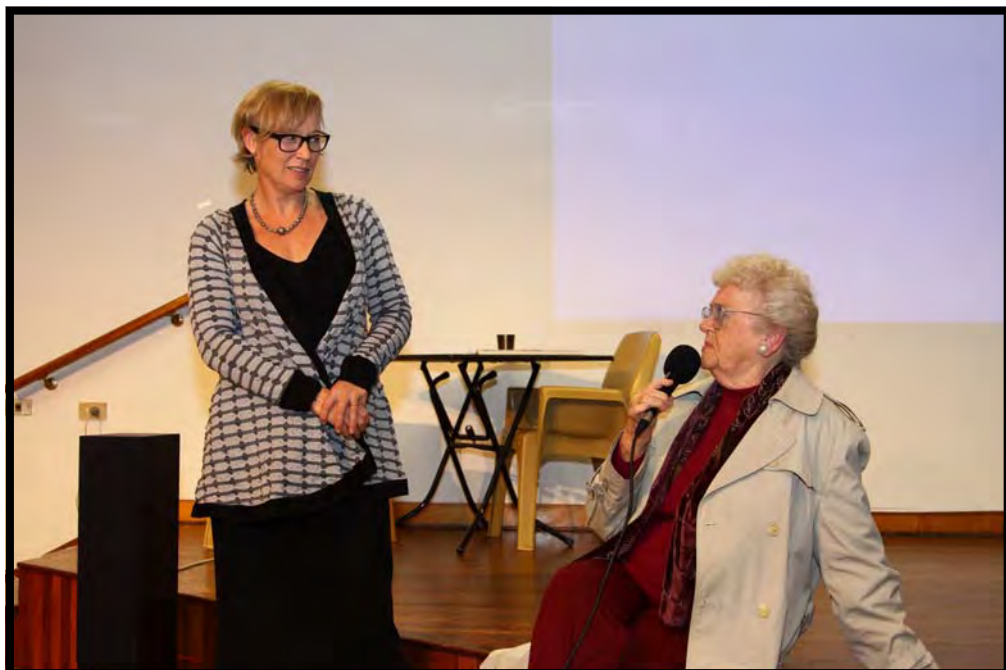
Good to see Mother and daughter at their best.

The Talented Hruby's are certainly a great part of the contemporary Australian film industry I am delighted to say