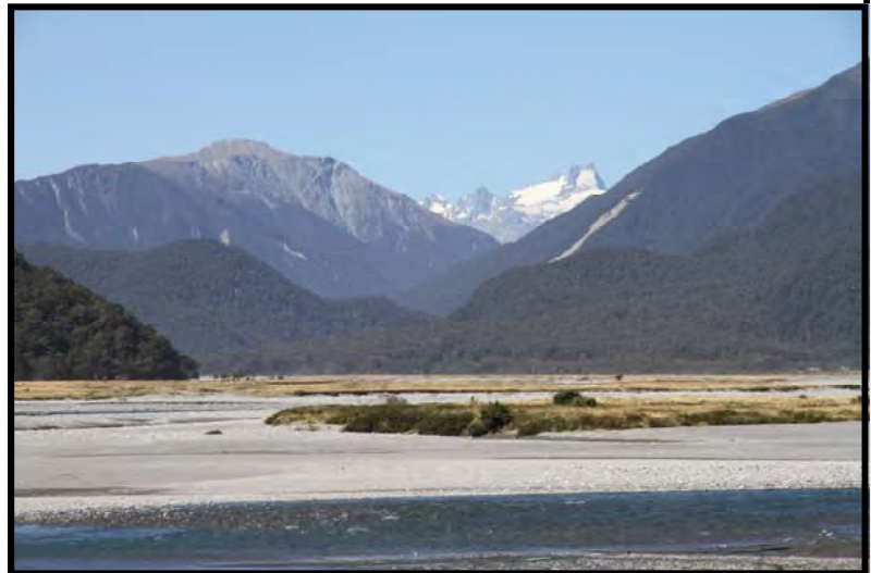
River & snow capped Mountain Scene.

Continuing on through the countryside we stopped for a break at Haast, a small village with some cottage industries selling clothes, honey,