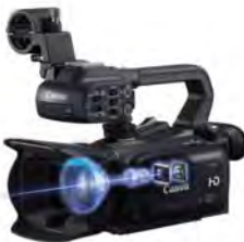
XA25 - Broadcast Quality