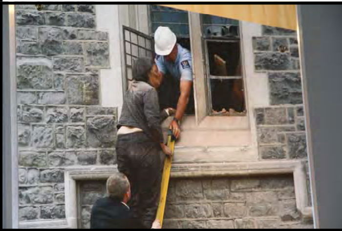
Human side after earthquake

down. The local people have been invited to put in a submission as to how they would like Christchurch rebuilt. There has been some 15000 idea's put forward. Later the CO and myself wondered around and photographed mother natures handy work. We returned to the hotel to meet our friends. We raised a glass of our favourite poison and toast a happy and successfully trip.