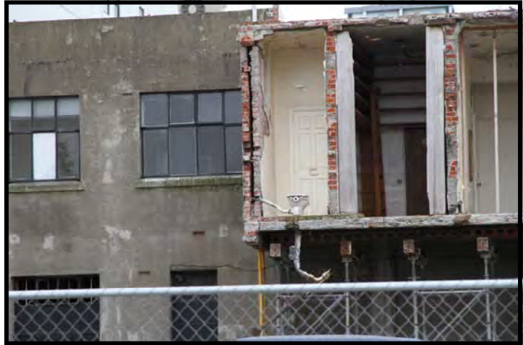
Fallen wall exposing Bathroom.

Our taxi driver took us on a tour of Christchurch before dropping us at our hotel. He showed us the damage done during the earthquake. What a disaster. One can only imagine the noise and dust, as well as what would be going through the peoples minds as the buildings were collapsing around them. The old historic buildings and churches all were badly damaged. They are beyond repair and many have since been pulled