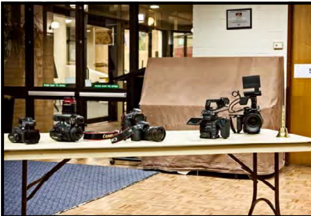
Selection of Canon Cameras