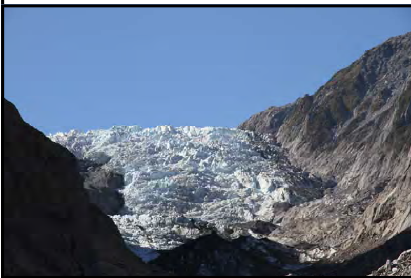
Franz Joseph Glacier Close Up

Franz Joseph Village 175 kms away. Franz Joseph Village is only a few kms. from the rather spectacular Franz Joseph Glacier, which in turn, is only 50 kms from Mt Cook (the highest mountain on the South Island of New Zealand.) In the village there is a number of motels, restaurants a supermarket, Tourist Information Centre. You may like to take a helicopter ride over the glacier. We all commented on