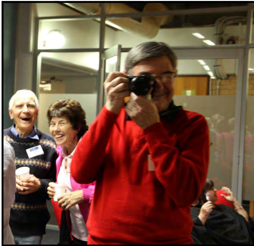
Everyone had a good laugh