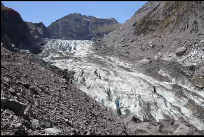
Fox Glacier covered in dust and debris.

had some distance to walk to get a look at this interesting natural phenomenon. The CO and our friends remain behind while I walked up the glacier face for a few photo's.