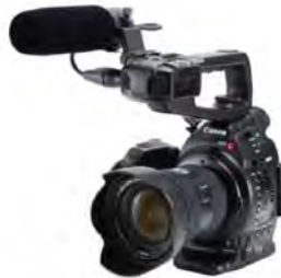
C100 - Amazing Quality