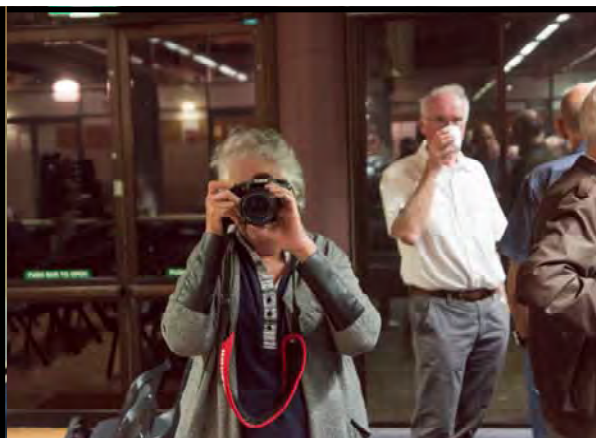
Me and my Team