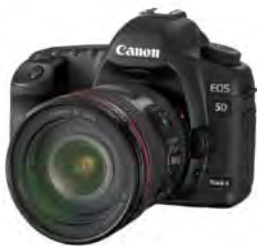
The Famous 5D!

We also saw the XA25 - probably the most affordable of the options from the evening, with dual XLR feeds, full broadcast quality HD and extreme portability it was a very attractive option, albeit not in everyone's price range.