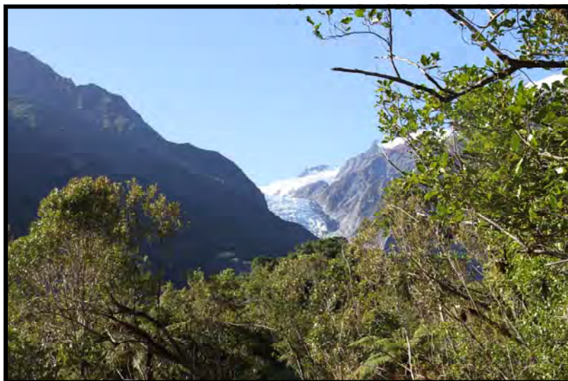
Franz Joseph Glacier in the Distance

We picked up our hire car and after a few hassles we loaded up and headed south for