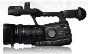
XF305 - As used by the BBC