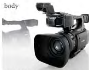
XF105 - Heavy Duty Prosumer