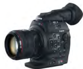
C300 - Start Saving Up!